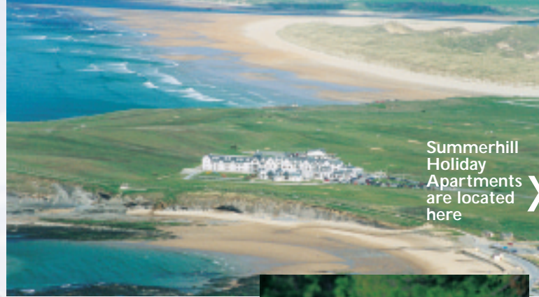
Summerhill Holiday Apartments are located here