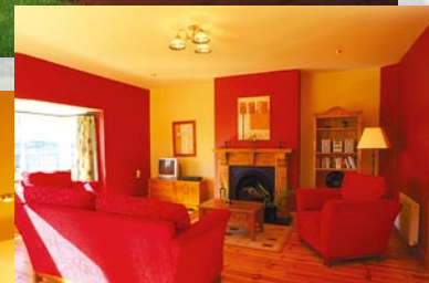
4 bed house

Four Bedroomed Detached These are incredibly spacious houses sleeping up to 8 people.