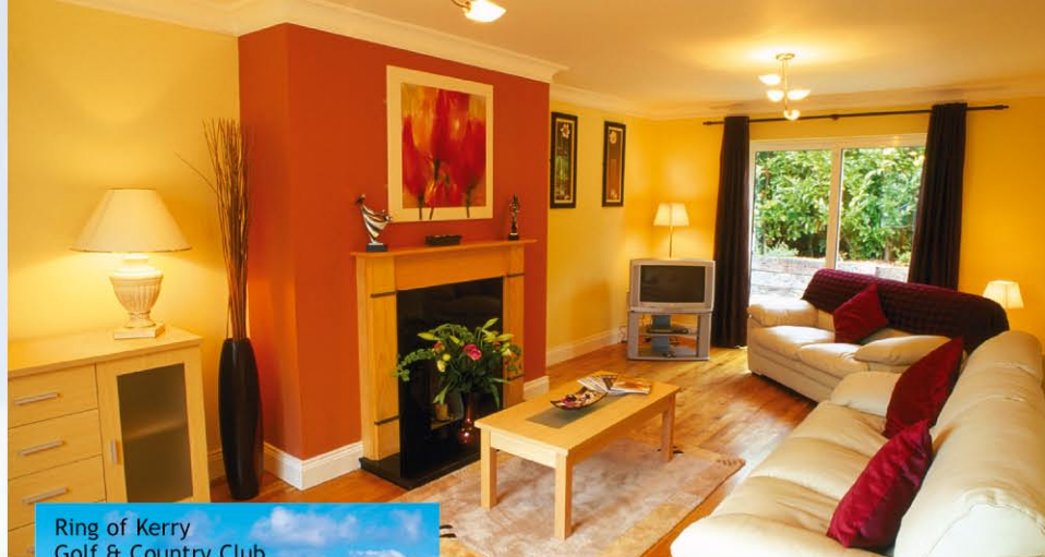
Ring of Kerry Golf & Country Club